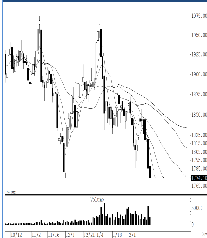
GOH21 (Close 1,774.10 Chg -11.40)

ราคาทองคำปรับตัวลงต่ำกว่าแถว ๆ 1,810 ดอลลาร์ ส่งผลให้ระยะกลางเริ่มดู อ่อนลง แนะนำ trading ในกรอบระหว่าง 1,810-1,720 ดอลลาร์ ระวังกำไร ในกรณีที่ปิดต่ำกว่า 1,715 แนะนำ ถือ short