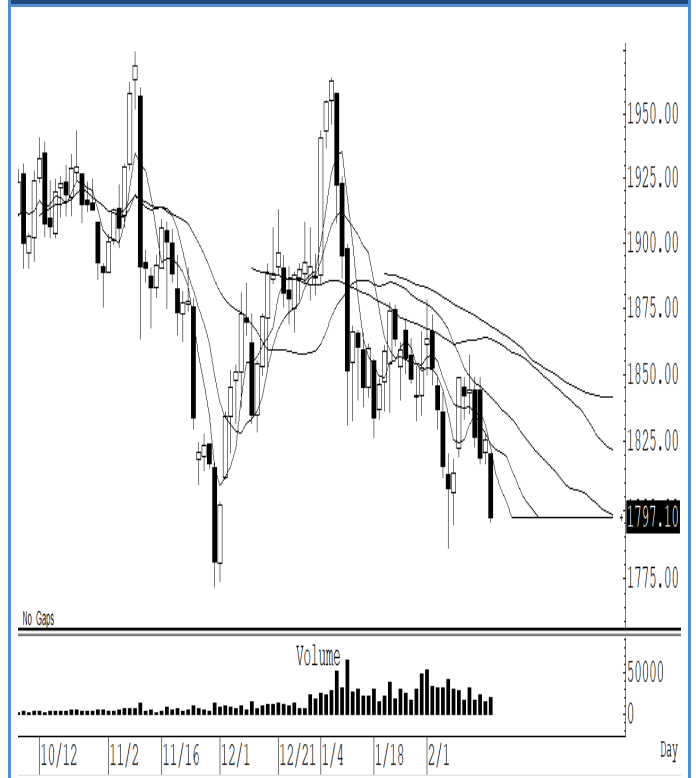
GOH21 (Close 1,798.00 Chg -27.90)

ราคาทองคำปรับตัวลงต่ำกว่าแถว ๆ 1,810 ดอลลาร์ ส่งผลให้ระยะกลางเริ่มดู อ่อนลง แนะนำ trading ในกรอบระหว่าง 1,810-1,720 ดอลลาร์ ระวังถ้าไร ในกรณีที่ปิดต่ำกว่า 1,715 แนะนำ ถือ short