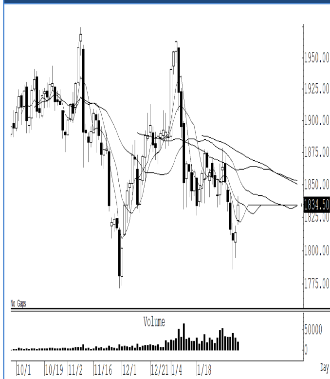
GOH21 (Close 1,834.50 Chg 21.00)

ราคาทองคำฟื้นตัวขึ้นมาใกล้เคียงกับที่คาด สั้น ๆ ไม่ต่ำกว่าแถว ๆ 1,820 ดอลลาร์ อาจจะมีตีดกลับได้อีกเล็กน้อย แนะนำ trading ในกรอบระหว่าง 1,820-1,850 ดอลลาร์ ระวังกำไร ในกรณีที่เปิดต่ำกว่า 1,820 ถือ short ต่อ