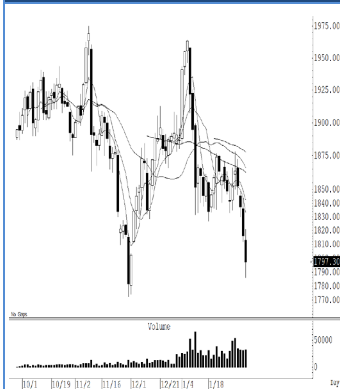
GOH21 (Close 1,797.30 Chg -18.90)

ราคาทองคำปรับตัวลง หลังต่ำกว่าระดับ 1,830 ดอลลาร์ สั้น ๆ ดีดกลับไม่ข้ามแถว ๆ 1,830 ดอลลาร์ แนะนำ trading ในกรอบระหว่าง 1,830-1,765 ดอลลาร์ รับรู้กำไร ปิดต่ำกว่า 1,760 ถือ short ต่อ