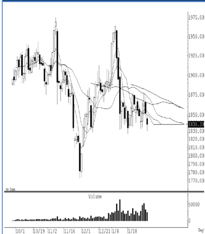
GOH21 (Close 1,838.30 Chg -14.00)

ราคาทองคำแกว่งตัวออกด้านข้าง เรามองว่าอยู่ในช่วงตัดสินแนวโน้มในเร็ว ๆ นี้แล้ว โดยใช้แนวรับแถว ๆ 1,810 จุดเป็นเกณฑ์ ปิดต่ำกว่านี้ แนะนำถือ short หวังผลปรับตัวลงไปแถว ๆ 1,700 ดอลลาร์ ระยะสั้นถ้ายังทรงตัวเหนือ 1,830 ดอลลาร์ได้ แนะนำ trading ในกรอบระหว่าง 1,830-1,860 ดอลลาร์ รับรู้กำไร ปิดต่ำกว่า 1,830 เน้นเล่นฝั่ง short