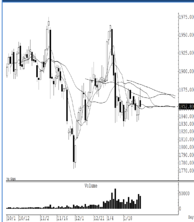
GOH21 (Close 1,852.80 Chg 0.30)

ราคาทองคำแกว่งตัวออกด้านข้าง ยังมีความไม่แน่นอนในทิศทางระยะสั้นอยู่เหมือนเดิม แนะนำ trading ในกรอบระหว่าง 1,870-1,830 ดอลลาร์ ระวังกำไร