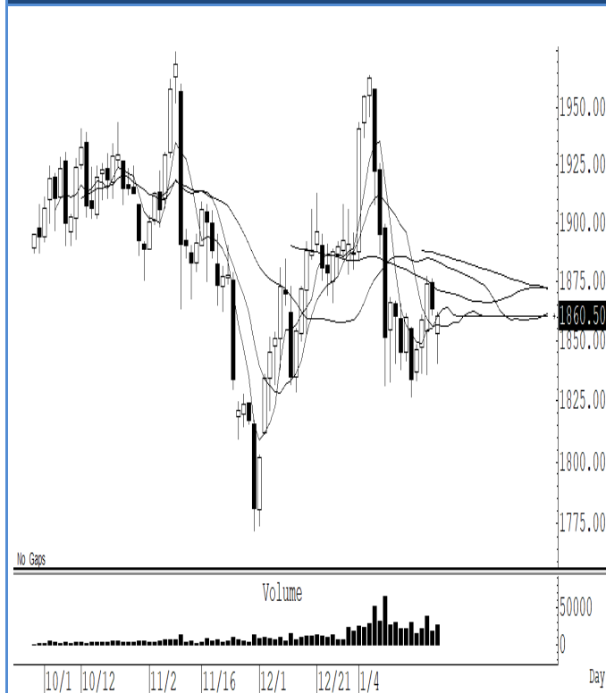
GOH21 (Close 1,860.50 Chg -2.70)

ราคาทองคำแกว่งตัวออกด้าน ยังมีความไม่แน่นอนในทิศทางระยะสั้นอยู่ เหมือนเดิม คาดว่าจะแกว่งในกรอบ แนะนำ trading ในกรอบระหว่าง 1,845-1,875 ดอลลาร์ ระวังกำไร