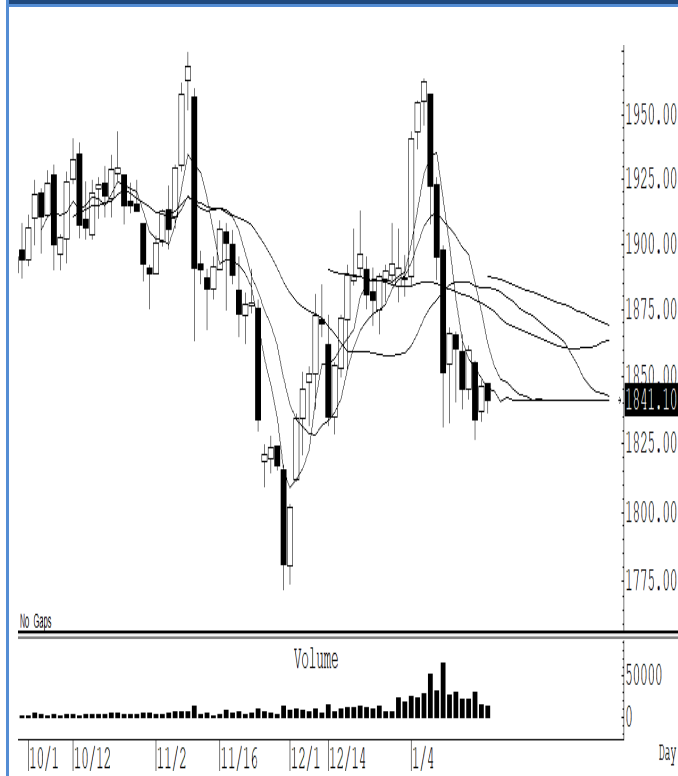
GOH21 (Close 1,841.10 Chg -5.20)

ราคาทองคำทรงตัวออกด้านข้าง สั้น ๆ ดัดกลับไม่ข้ามแถว ๆ 1,850 ดอลลาร์ แนะนำ trading ในกรอบระหว่าง 1,850-1,800 ดอลลาร์ ระวังกำไร