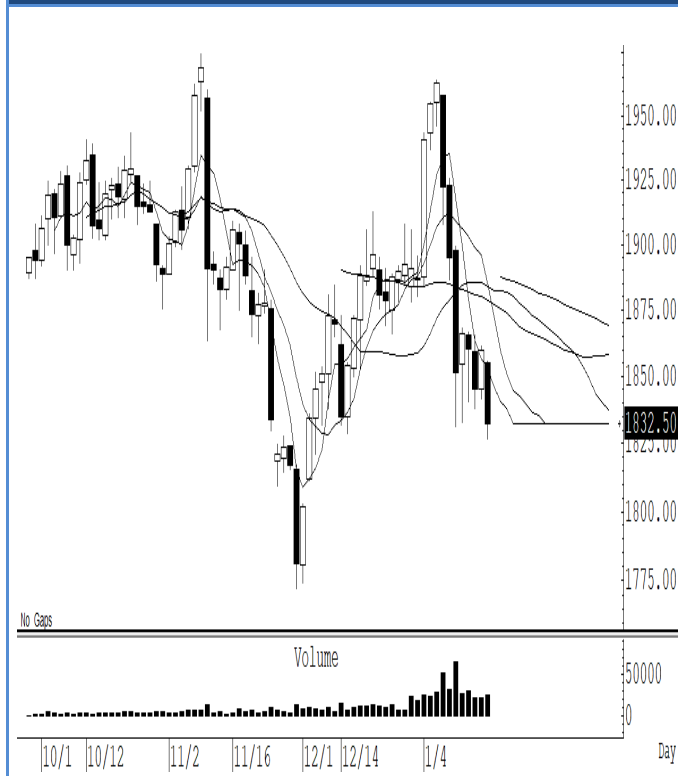
GOH21 (Close 1,832.50 Chg -27.10)

ราคาทองคำปรับตัวลงต่ำกว่า 1,830 ดอลลาร์เรียบร้อย สั้น ๆ ดึงกลับไม่ข้าม แถว ๆ 1,845 ดอลลาร์ แนะนำ trading ในกรอบระหว่าง 1,845-1,800 ดอลลาร์ ระวังถ้าไร ในกรณีที่ปิดต่ำกว่า 1,800 ดอลลาร์ แนะนำ ถือ short