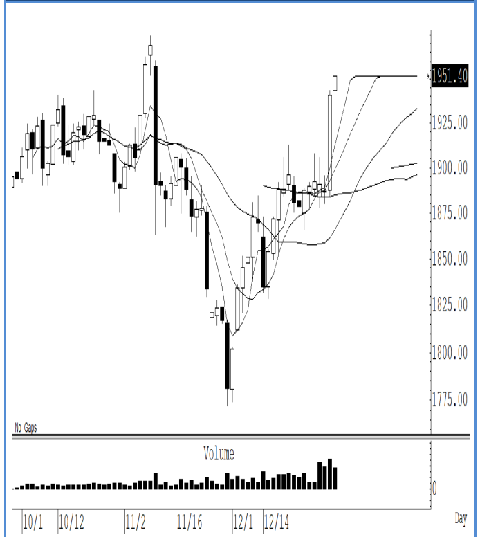
GOH21 (Close 1,951.40 Chg 10.80)

ราคาทองคำกลับขึ้นไปปิดเหนือ 1,930 ดอลลาร์ได้อีกครั้ง สั้น ๆ ไม่ต่ำกว่าแนวรับแถว ๆ 1,900 ดอลลาร์ แนะนำ trading ในกรอบระหว่าง 1,900-1,970 ดอลลาร์ รับรู้กำไร