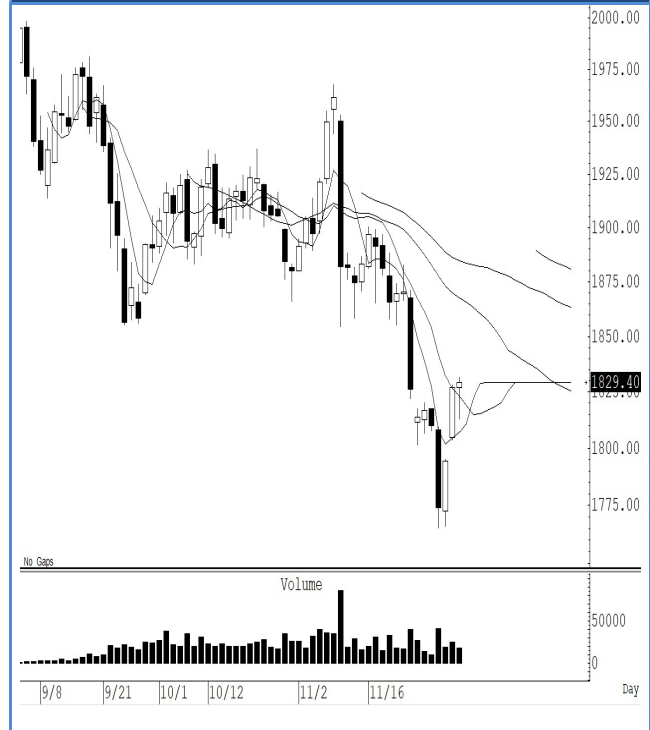
GOZ20 (Close 1,829.40 Chg 2.40)

ราคาทองคำฟื้นตัวดีกว่าคาดเล็กน้อย สั้น ๆ ไม่ต่ำกว่าแนวรับแถว ๆ 1,815 ดอลลาร์ เราแนะนำ trading ในกรอบระหว่าง 1,815-1,840 ดอลลาร์ ระวังกำไร