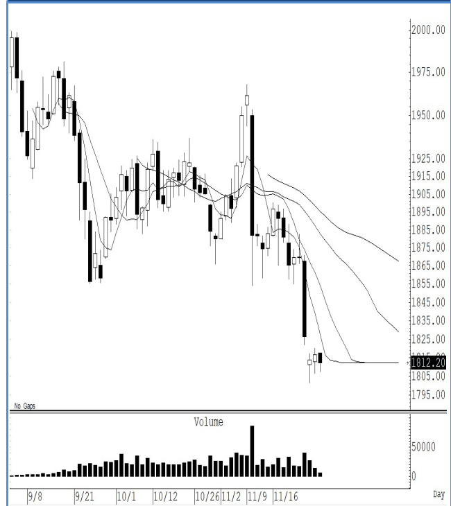
GOZ20 (Close 1,812.20 Chg -4.50)

ราคาทองคำทรงตัว เรายังมีแนวโน้มที่ราคาทองคำจะปรับตัวลงไปทดสอบ แนวโน้มสำคัญในระยะกลาง (1,750) สั้น ๆ ดึงกลับไม่ข้ามแถว ๆ 1,840- 1,860 ดอลลาร์ เรายังแนะนำ trading short ในกรอบระหว่าง 1,850-1,760 ดอลลาร์ ระบุกำไร หรือปิดต่ำกว่าระดับ 1,800 ดอลลาร์ แนะนำถือ short