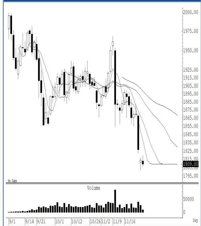
GOZ20 (Close 1,809.00 Chg -4.80)

ราคาทองคำเริ่มทรงตัว หลังปรับตัวลงมาแรง เรามองมีแนวโน้มที่ราคาทองคำจะปรับตัวลงไปทดสอบแนวโน้มสำคัญในระยะกลาง (1,750) สั้น ๆ ดึงกลับไม่ข้ามแถว ๆ 1,840-1,860 ดอลลาร์ เราแนะนำ trading short ในกรอบระหว่าง 1,850-1,760 ดอลลาร์ ระวังกำไร