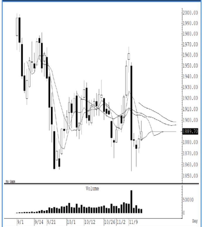
GOZ20 (Close 1,889.70 Chg 6.60)

ราคาทองคำฟื้นตัวอย่างค่อยเป็นค่อยไป สั้น ๆ ไม่ต่ำกว่าแนวรับแนว ๆ 1,875 ดอลลาร์ แนะนำ trading ในกรอบระหว่าง 1,875-1,930 ดอลลาร์ รับรู้กำไร