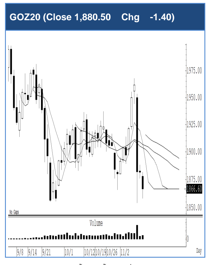
ราคาทองคำทรงตัวในเช้าวันนี้ สั้น ๆ ไม่ต่ำกว่าแนวรับแถว ๆ 1,845 ดอลลาร์ แนะนำ trading ในกรอบระหว่าง 1,845-1,910 ดอลลาร์ รับรู้กำไร แต่ถ้าปิดต่ำกว่า 1.845 ดอลลาร์ แนะนำ ถือ short