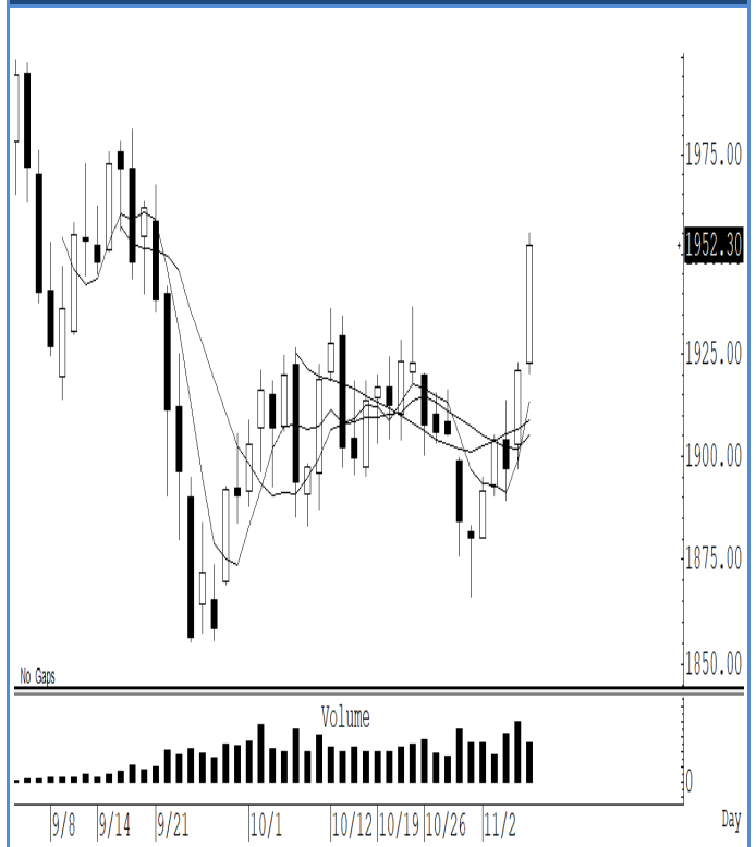
GOZ20 (Close 1,952.30 Chg 31.10)

ราคาทองคำปรับตัวขึ้นแรง แต่เข้านี้เริ่มทรงตัวมีแรงขายทำกำไรออกมาบ้าง สั้น ๆ ไม่ต่ำกว่าแนวรับแถว ๆ 1,897 ดอลลาร์ แนะนำ trading ในกรอบ ระหว่าง 1,897-1,955 ดอลลาร์ รับรู้กำไร