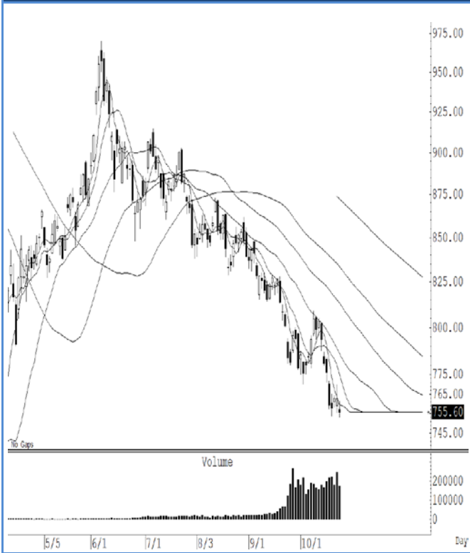
S50Z20 (Close 755.60 Chg -7.10)