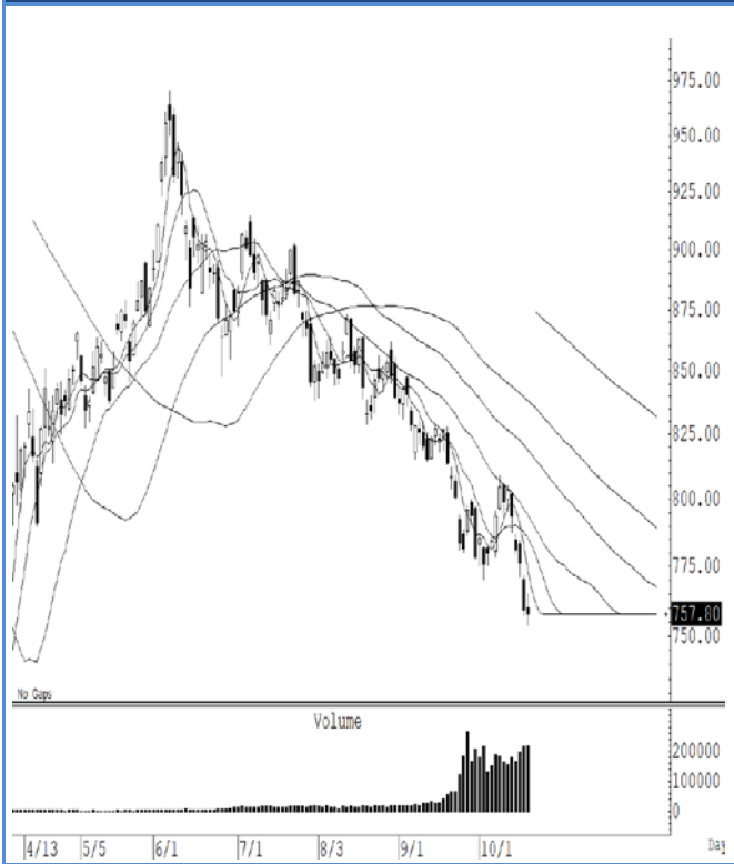
S50Z20 (Close 757.80 Chg -1.50)