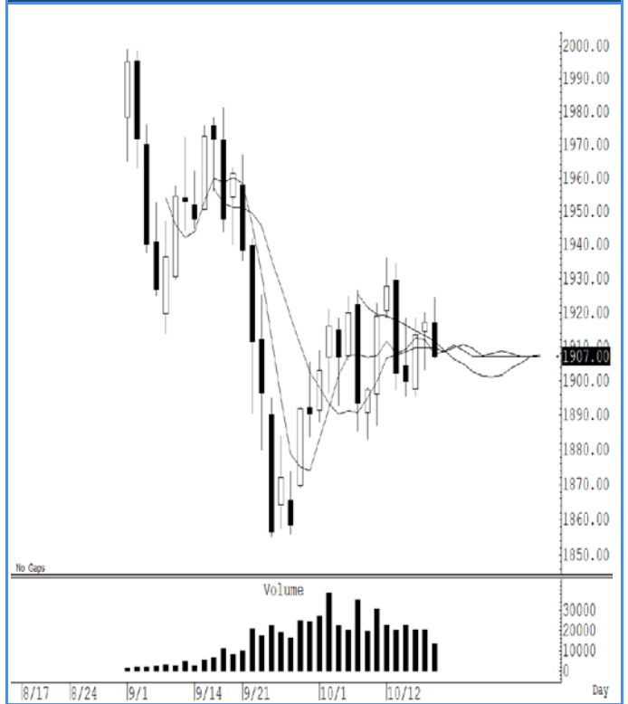
GOZ20 (Close 1,907.00 Chg -10.00)

ราคาทองคำทรงตัวในเช้าวันนี้ ยังไม่มีทิศทางที่ชัดเจน สั้น ๆ ไม่ต่ำกว่าแนวรับแถว ๆ 1,900 ดอลลาร์ แนะนำ trading ในกรอบระหว่าง 1,890-1,930 ดอลลาร์ ระวังกำไร