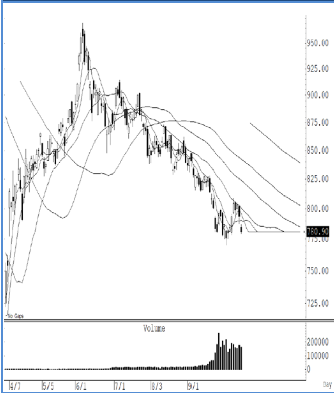
S50Z20 (Close 780.90 Chg -12.90)