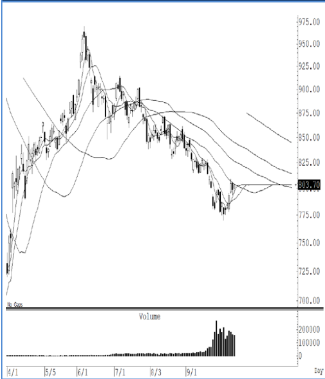
S50Z20 (Close 803.70 Chg 4.60)