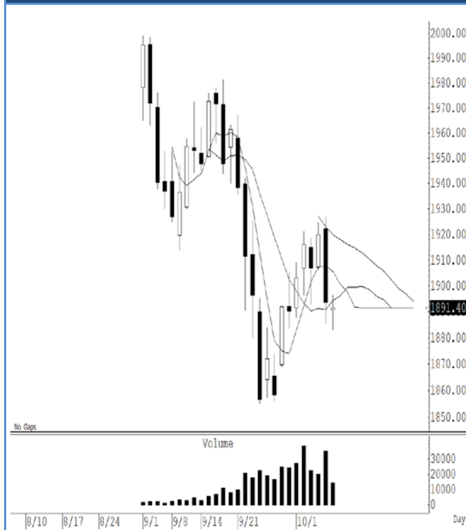
GOZ20 (Close 1,893.10 Chg -2.20)

ราคาทองคำทรงตัวในเช้าวันนี้ หลังวานนี้ฟื้นตัวกลับขึ้นมา สั้น ๆ ดึงกลับไม่ข้ามแถว ๆ 1,905 ดอลลาร์ แนะนำ trading ในกรอบระหว่าง 1,905-1,850 ดอลลาร์ รับรู้กำไร