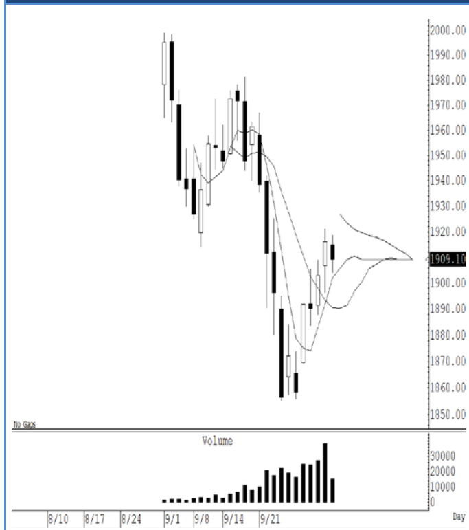
GOZ20 (Close 1,909.10 Chg -7.00)

ราคาทองคำทรงตัวในเช้าวันนี้ สั้น ๆ ไม่ต่ำกว่าแนวรับแถว ๆ 1,885 ดอลลาร์ แนะนำ trading ในกรอบระหว่าง 1,885-1,920 ดอลลาร์ รับรู้กำไร