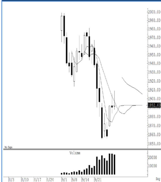
GOZ20 (Close 1,892.60 Chg 2.20)

ราคาทองคำฟื้นตัวเล็กน้อยในเช้าวันนี้ หลังเมื่อคืนนี้ฟื้นตัวไม่ข้ามแนวต้านแนว ๆ 1,902 ดอลลาร์ สั้น ๆ ไม่ต่ำกว่าแนวรับแนว ๆ 1,880 ดอลลาร์ แนะนำ trading ในกรอบระหว่าง 1,880-1,900 ดอลลาร์ ระวังกำไร ในกรณีที่ปิดต่ำกว่าระดับ 1,875 ดอลลาร์ แนะนำ ถือ short