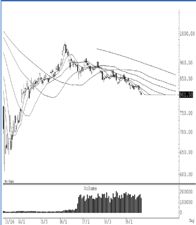
S50U20 (Close 801.50 Chg -7.70)

ปรับตัวลงต่อ และปิดใกล้จุดต่ำสุดของวัน สั้น ๆ ดิดกลับไม่ข้ามแถว ๆ 811 จุด แนะนำ trading ในกรอบระหว่าง 811-791 จุด ระวังกำไร