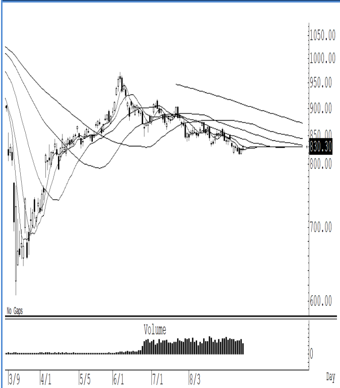
S50U20 (Close 830.30 Chg 3.60)