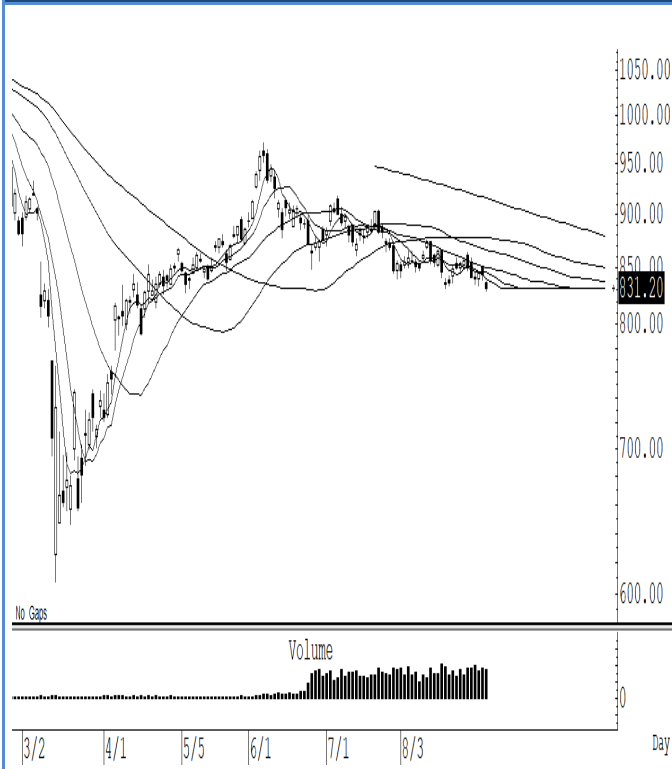
S50U20 (Close 831.20 Chg -12.50)

ปรับตัวลงต่อ ทำจุดต่ำใหม่เล็กน้อย คาดว่า วันนี้ น่าจะแกว่งลงต่อ สั้น ๆ ดึงกลับไม่ข้ามแถว ๆ 838 จุด แนะนำ trading ในกรอบระหว่าง 838-811 จุด ระวังกำไร