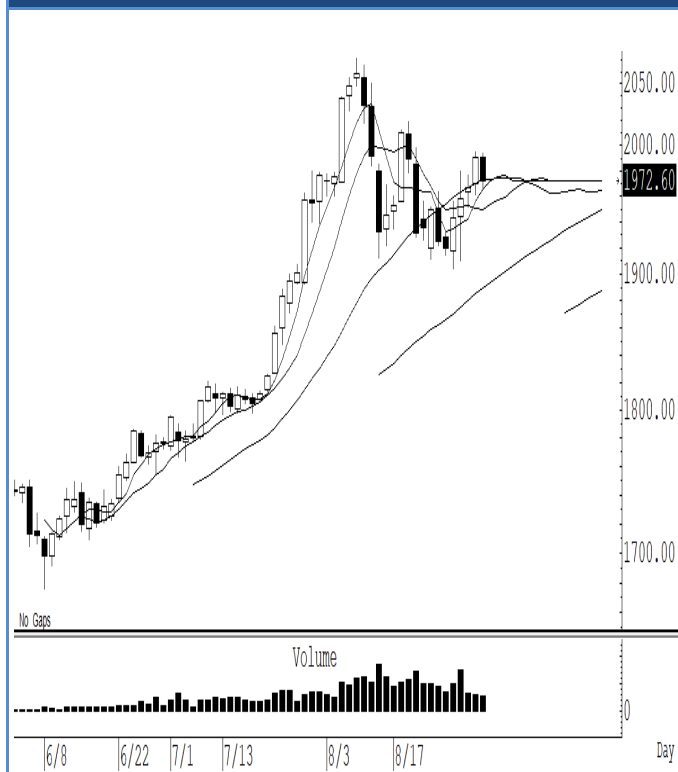
GOU20 (Close 1,969.30 Chg 2.40)

ราคาทองคำอ่อนตัวลงเล็กน้อยในเช้าวันนี้ สั้น ๆ ไม่ต่ำกว่าแนวรับแถว ๆ 1,950 ดอลลาร์ แนะนำ trading ในกรอบระหว่าง 1,950-1,995 ดอลลาร์ รับรู้กำไร