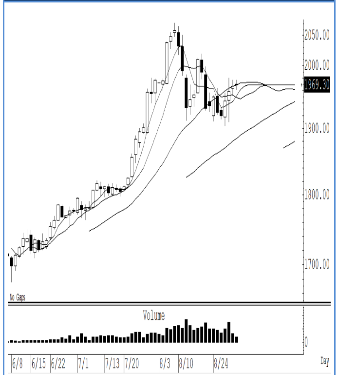
GOU20 (Close 1,969.30 Chg 2.40)

ราคาทองคำทรงตัวในเช้าวันนี้ สั้น ๆ ไม่ต่ำกว่าแนวรับแถว ๆ 1,955 ดอลลาร์ แนะนำ trading ในกรอบระหว่าง 1,955-2,020 ดอลลาร์ ระวังกำไร