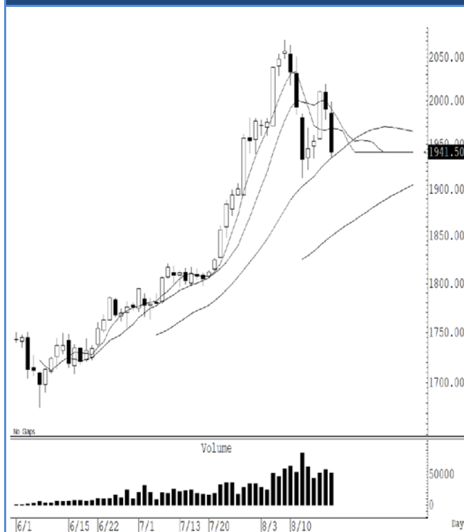
GOU20 (Close 1,941.50 Chg -48.00)

ราคาทองคำทรงตัวในเช้าวันนี้ หลังปรับตัวลงแรงในการซื้อขายเมื่อคืนนี้ สั้น ๆ ไม่ข้ามแถว ๆ 1,965 ดอลลาร์ แนะนำ trading ในกรอบระหว่าง 1,965-1,865 ดอลลาร์ รับรู้กำไร ในกรณีที่ปิดต่ำกว่า 1,860 ดอลลาร์ แนะนำ ถือ short