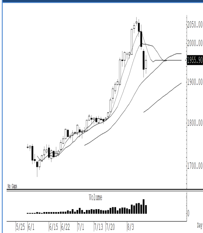
GOU20 (Close 1,955.90 Chg 22.90)

ราคาทองคำปรับตัวทรงตัวในเช้าวันนี้ สั้น ๆ ดึงกลับไม่ข้ามแถว ๆ 1,960 ดอลลาร์ แนะนำ trading ในกรอบระหว่าง 1,960-1,870 ดอลลาร์ ระวังกำไร แต่ถ้าในกรณีที่ขึ้นเหนือ 1,960 ดอลลาร์ แนะนำ short แถว ๆ 1990 ดอลลาร์