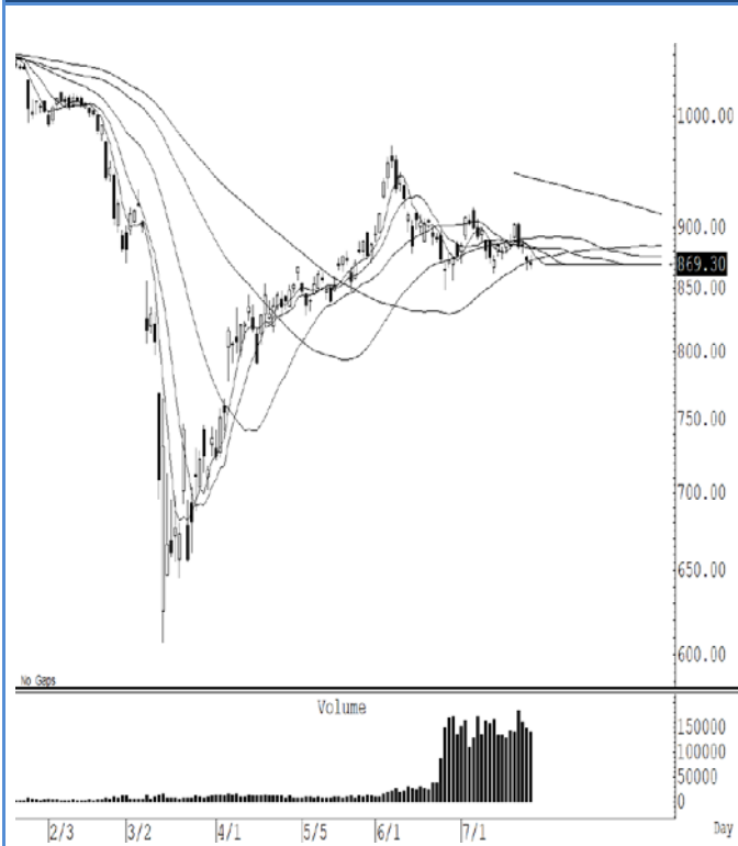
S50U20 (Close 869.30 Chg -3.10)