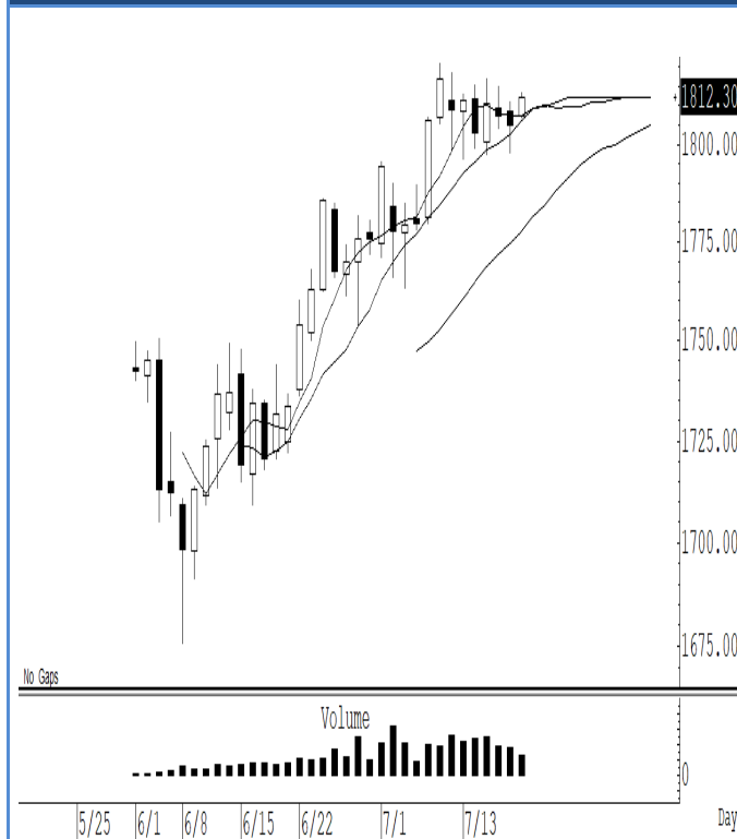
GOU20 (Close 1,812.30 Chg 7.30)

ราคาทองคำทรงตัวในเช้าวันนี้ สั้น ๆ ไม่ข้ามแนวต้านแถว ๆ 1,815 ดอลลาร์ แนะนำ trading ในกรอบระหว่าง 1,815-1,775 ดอลลาร์ ระวังกำไร