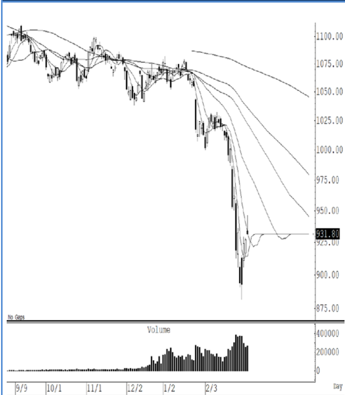
S50H20 (Close 931.80 Chg 4.40)