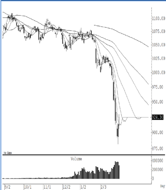
S50H20 (Close 924.30 Chg 31.00)