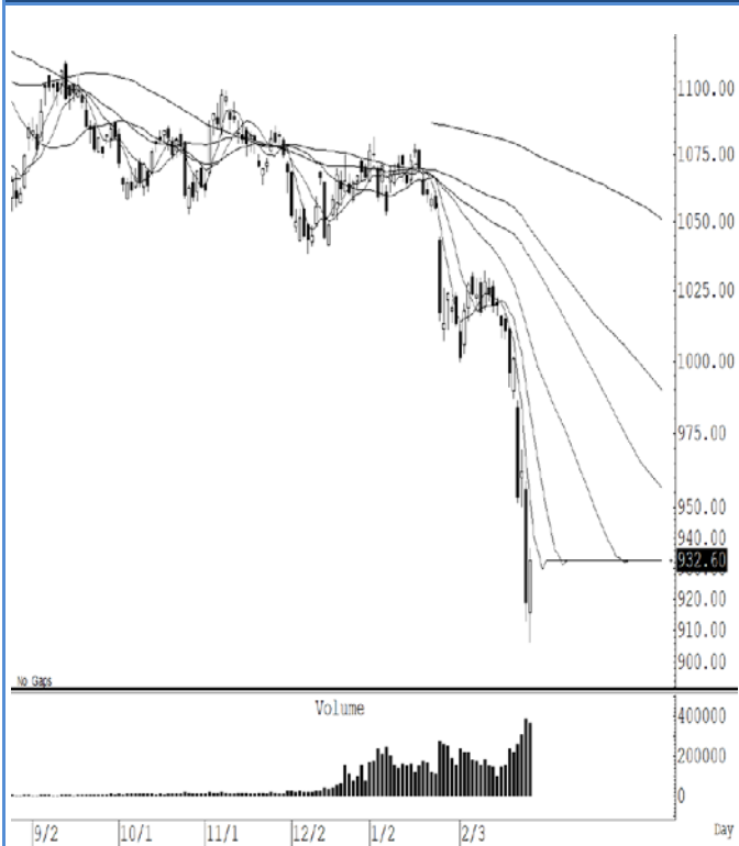
S50H20 (Close 932.60 Chg -13.70)