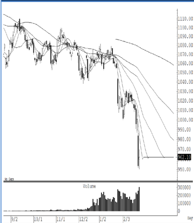
S50H20 (Close 962.10 Chg 8.50)