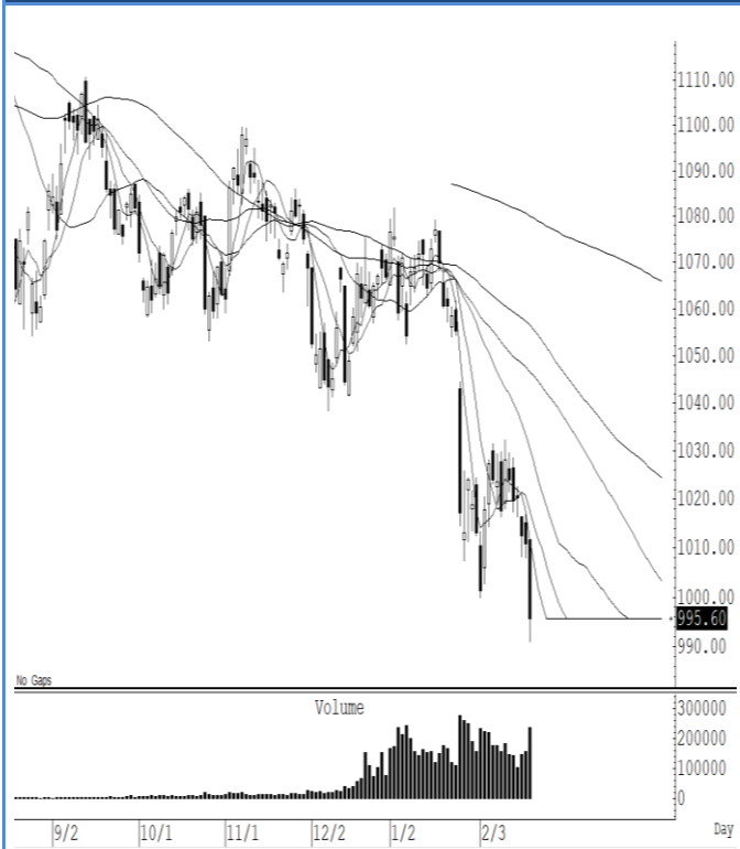
S50H20 (Close 995.90 Chg -14.90)