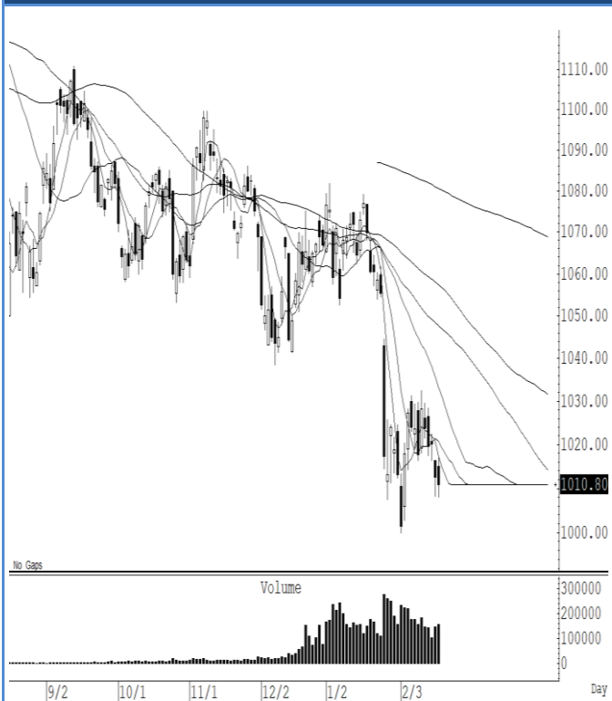
S50H20 (Close 1,010.80 Chg -1.70)