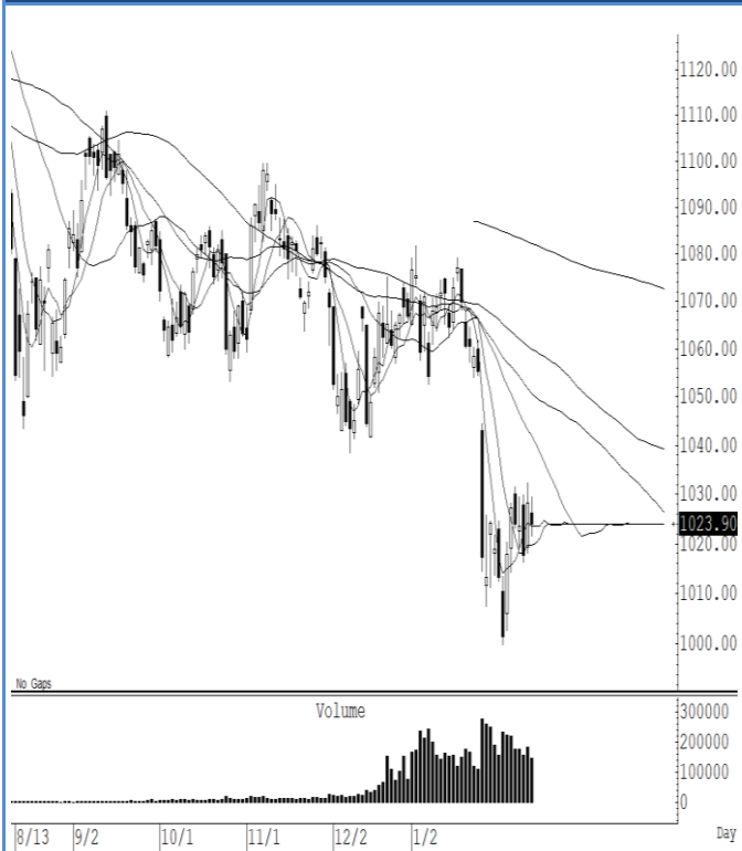
S50H20 (Close 1,023.90 Chg -4.30)