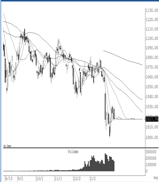
S50H20 (Close 1,017.70 Chg -5.90)