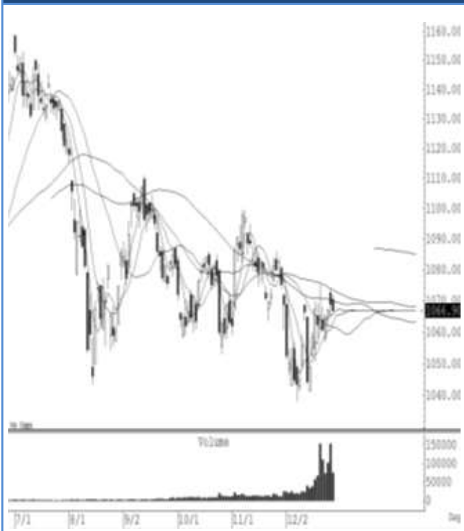
S50H20 (Close 1,066.90 Chg -1.90)